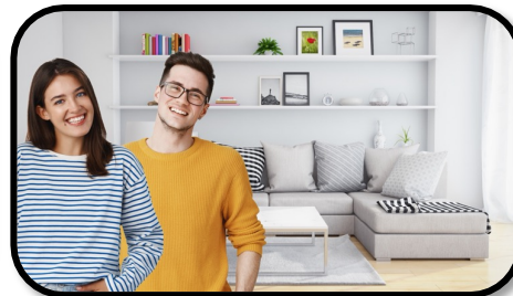
They're friends. They're in the living room.