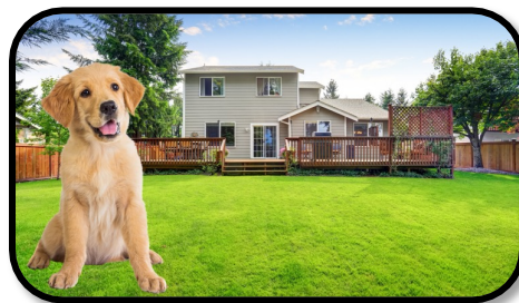
It's Max. It's in the yard.