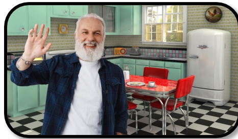
You're Henry. You're in the kitchen.