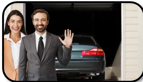
You're Mr. and Mrs. Smith. You're in the garage.