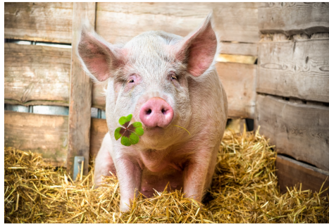
Curly is fatter.