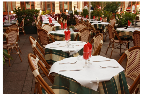
The Grill House restaurant is the closest.