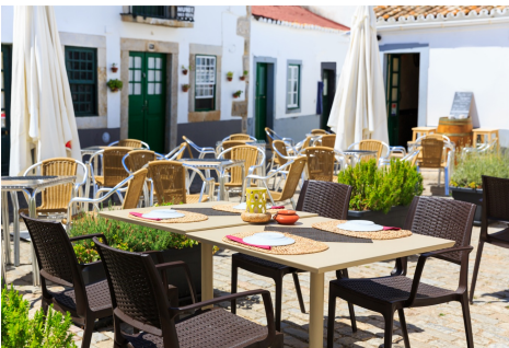
The Burger Palace restaurant is close.