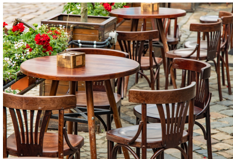
The Fresco Kitchen restaurant is closer.