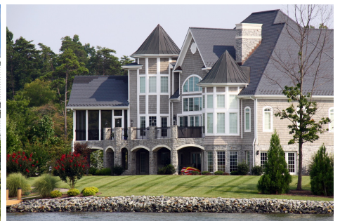
House 1213 is the biggest.