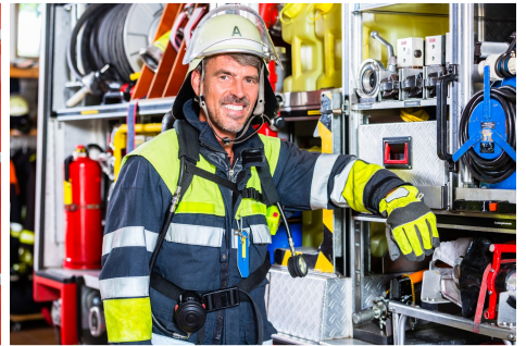
Chase is the bravest.