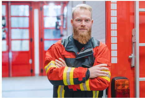
Chester is braver.