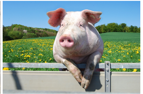
Oinky is the fattest.