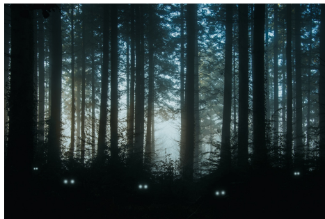
The Shadow Grove forest is creepier.