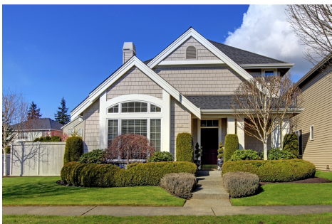
House 4805 is big.