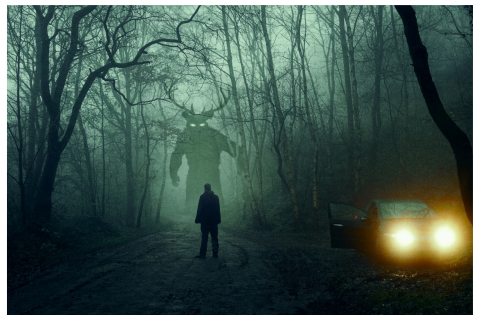
The Deadwood forest is the creepiest.