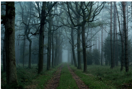
The Twisted Wood forest is creepy.