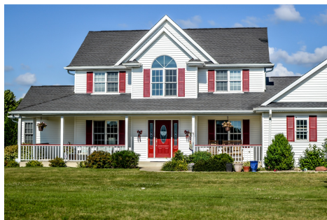
House 333 is bigger.