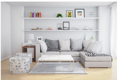
Heidi's decoration is simple.