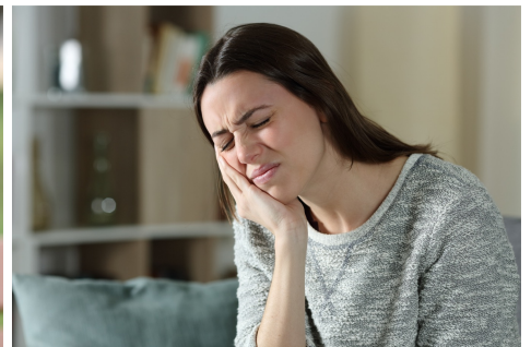
A toothache is the most painful.