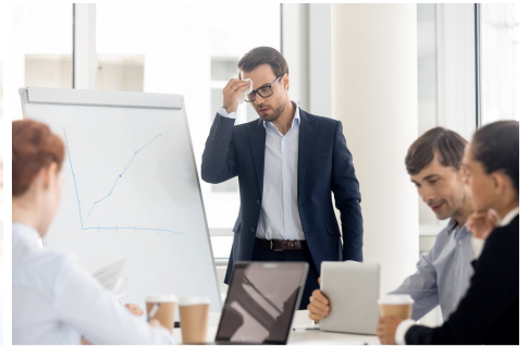
Fenix is the most anxious.