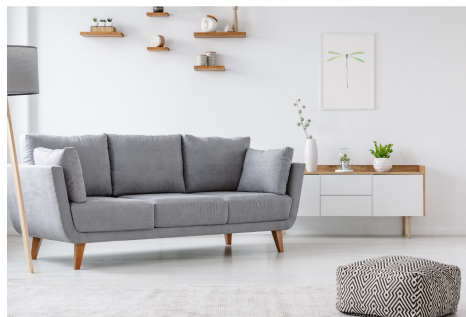
Heather's decoration is simpler.