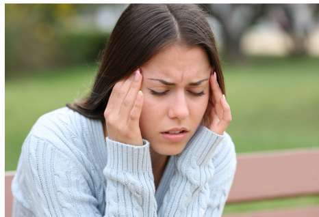
A headache is more painful.