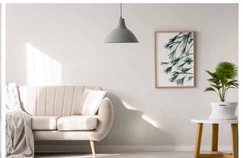
Hillary's decoration is the simplest.