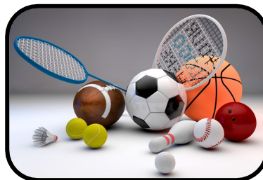
11. sports equipment