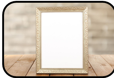
5. photo frame