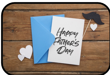
13. greeting card