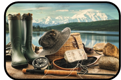
9. fishing gear