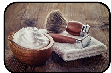
12. shaving kit