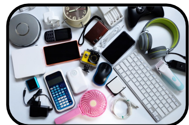
15. electronic gadgets