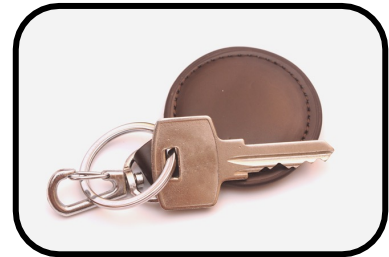
6. key chain